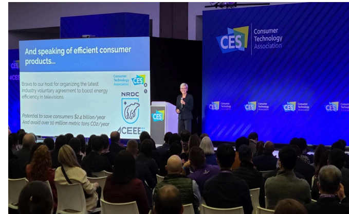
U.S. Secretary of Energy Jennifer Granholm highlights the new energy efficiency voluntary agreement for TVs at CES 2023.